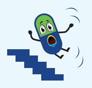
Falls & fractures